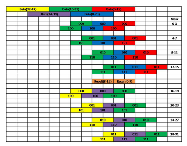
Figure 1. Computational arrangement for fast pattern matching. Data inboxes is the imm8 value

The main decision in the GPU programming is the design criterion of how memory will be used. We have decided to place the mask data in constant memory and the image and the result data in global memory. The image is constant in the algorithm but it does not fit in the small constant memory of the GPU. The CUDA programming methodology [Nvi09a] allows arranging the processors as a grid of threads. In our problem, the grid of threads is configured by assigning a thread to each result pixel at (x, y) excluding the border band; that is, each thread is involved in the computation of a R(x,y)result. To reduce the negative effects of memory access, the mask data are placed in constant memory because this type of memory is cached and is smaller in size than the mask data. Also, we take advantage of broadcast access to that memory type because for (u, v) values of the mask indexes all the threads access to the same M(u, v), which takes advantage of the broadcast access to constant memory.