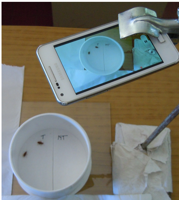
Figure 1: The mobile version of the system, capturing video before processing it. This is all the setup required by the zoologists to test the EOs repellent effect.

Argentina. Paper discs of 18cm diameter were divided on two halves; one half was treated with 1ml of an essential oil, and the other remained non-treated. The paper discs were then placed inside Petri dishes, covered with 10cm plastic rings treated with vaseline to prevent the escape of the roaches. The videos were recorded during 30 minutes in closed rooms with controlled moisture and temperature conditions, and were later brought to our laboratory to be processed. After improving the algorithms (specially the path tortuosity analysis) the application is now run on a mobile cellphone, which allows the researchers to record the video, analyze it, and obtain the results almost immediately (see Fig. 1).