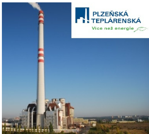
Figure 2 – Plzeňská teplárenská, a.s.

block for supply of electricity and ancillary services is 137 MWe installed capacity block K7 + TG3 is currently 13.5 MWe.