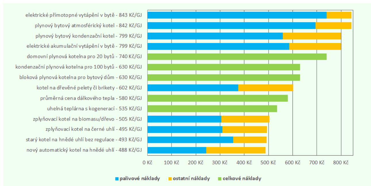
Figure 5 – Purchase price of energy at different sources [2]

The chart compares the annual cost of heating and hot water. For the most common methods of heating are taken into account all the essential items that make up the cost of producing heat in the Czech average four-person household, who live in an apartment with an area of 70 m 2 and has an annual energy consumption for heating and hot water 36 GJ = 10 MWh (1 GJ = 277, 8 kWh). When comparing electricity tariffs were used ČEZ Etarif and natural gas tariff RWE January 2013 (7.5-15 MWh). The scope of the final price of heat in the cheapest and most expensive alternative suppliers of electricity for storage heating from 742 to 796 CZK / GJ for heaters is 777 to 822 GJ for natural gas condensing boiler is the price range of 668 to 887 CZK / GJ and atmospheric boiler to 685 to 922 CZK / GJ.