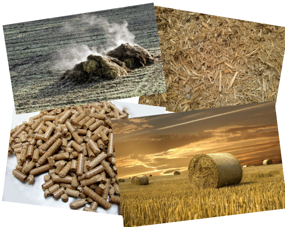
Figure 1 – Types of biomass

Biomass is primarily used for energy purposes. Biomass energy can be obtained in several ways: