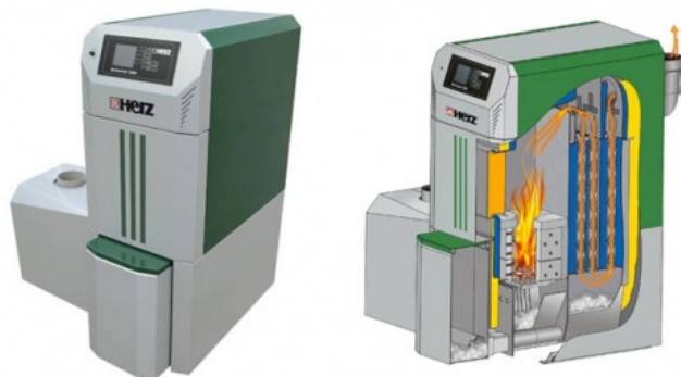
Figure 4 – Biomass boiler

This type of heating is used in smaller villages and households themselves. Among the local heaters belong fireplace, classical, steel, ceramic and cast iron stoves and brick kilns. They may be involved in coordination with central heating and is connected to the heater circuit. These heaters have a low running cost and cheap fuel (biomass). The very local heaters can cover the heat demand in periods of transition. Savings can be as high as 30%.