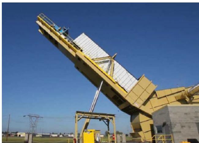
Figure 3 – Truck dump at CHP plants [7]

This biomass used in power plant travels on transport belts from storage to the boiler. Energy created by combustion process creates steam used to spin steam turbine generator. Problem of decentralised CHP units can be that they are often remotely located from urbanised areas. [7]