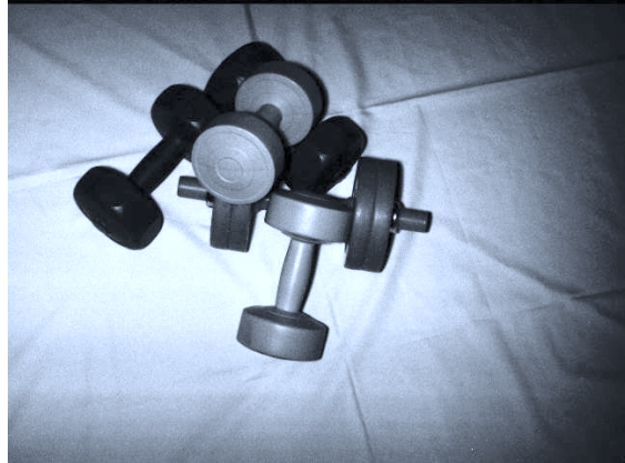
Figure 1: Intensity image of the scene

it appeared reasonable to use a median filter with a 15 \times 15 operator window. The drawback is that we lose a high amount of range information so that the spatial relation of the extracted features is inconsistent in many cases.