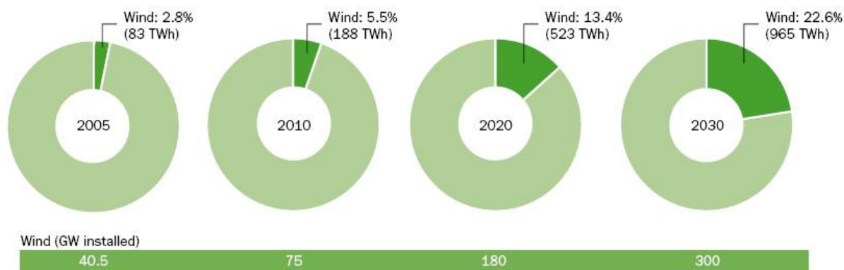
Figure 2: Contribution of wind energy to European electricity consumption 2005 -2030 [2].

A wind-powered future would mean reduced risks associated with fossil and nuclear fuels. Wind power entails no geo-political risk, reduces external energy dependence, reduces the need for energy imports, has no fuel costs, no fuel price risk, no resource constraints, no CO 2 and other harmful emissions and no radioactive waste. Reliable, clean power for European domestic consumers and reduced power costs for increasingly high energy use industries can be obtained, and more cheaply than today. Energy is fundamental to any economy; wind energy can be a driver for European growth. With the right kind of collaboration and investment, electricity production from wind and its contribution to meeting European electricity consumption could raise from 83 TWh in 2005 to 965 TWh by 2030, supplying 23% of European electricity. This projection takes into account that consumption is expected to increase by half over the same period [2].