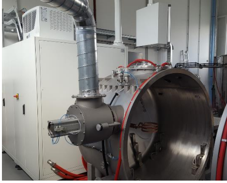
Fig. 6: Induction system HFG160