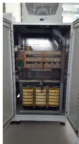
Fig. 1: High-frequency generator

The part of high-frequency generator is shown in the Fig.1.