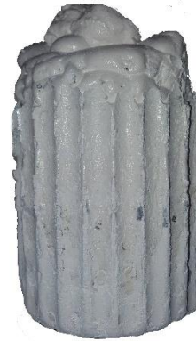
Fig. 9: Mixture of Al_2O_3 and ZrO_2