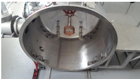
Fig. 3: Chamber

It is necessary to use a protective atmosphere (e.g. argon) for melting materials which react with oxygen (e.g. titan) to avoid negative properties of the final material.