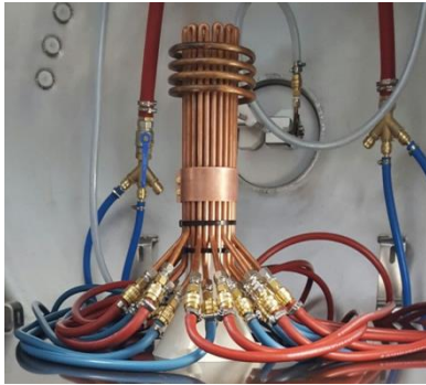
Fig. 2: Segmented Cold crucible

are using segmented cold crucible in our application which is shown in the Fig.2. This cold crucible was created by our research group.