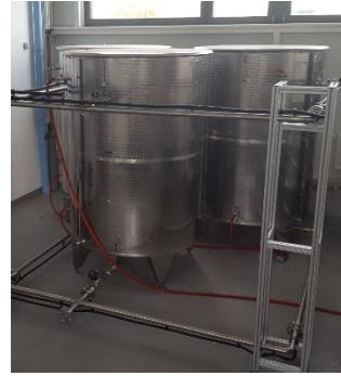
Fig. 4: Cooling tanks

Quality cooling system is essential to safe operation of the device. Almost all components of induction system are heavily water-cooled. The most commonly the cooling system with heat exchanger is used. Our laboratory does not have a heat exchanger and it uses three stainless steel tanks which are switched as needed not to exceed maximum allowed inlet temperature for the generator. Maximum allowed temperature of cooling water in the system is set between 30-35 °C.