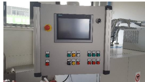
Fig. 5: User interface of control system - Siemens Simatic

To use such as complicated device it is necessary to have quality control system that provides all necessary functions. The core of control system is usually based on industrial PLC. The control system evaluates the measured values and performs safety functions. In case of sudden failure the entire facility is safely shut down. The control system is equipped with a user interface that allows operator to monitor measured quantities of the cold crucible. The measured data are stored on flash drive. Data can be also moved, processed and evaluated on a PC. The user interface of control system is shown in the Fig.5.