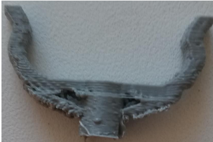
Figure 4. Finished part

The part made with the help of 3D-printer has successfully fulfilled its function in the table lamp.