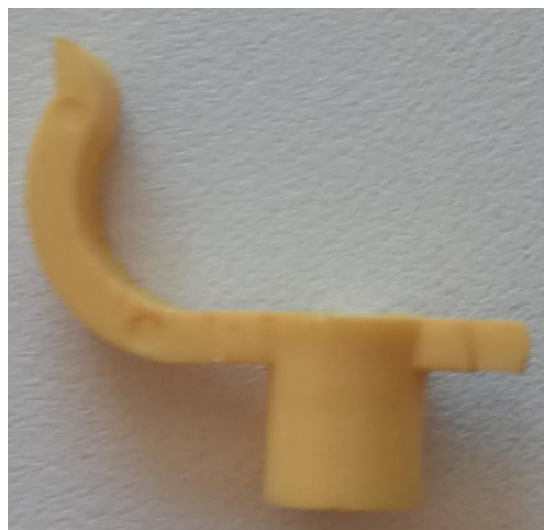
Figure 1. Broken part

New possibilities of the innovative 3D modeling technologies are undeniable and widely advertised, but, as a rule, on the examples of the products with a conditional practical significance (pictures, toys, decorations, etc.) Taking into consideration the practice oriented focus of the technology lessons, we wanted to find the object of labor, manufacturing which would be a real human life requirement and demonstrate an alternative to the traditional solution of the tasks. We would formulate the problem situation taken from the life as: In Russia, the products which were manufactured in China are widely distributed, they are popular in a certain sense due to their wide functional capabilities and relatively low prices. However, it is often necessary to deal with their insignificant breakdowns of the plastic parts at the first glance, which leads to the impossibility of further the device use. The one family was confronted the problem in which at the current moment they bought the fourth table lamp just because in the first three ones the plastic holders of a fluorescent lamp has been broken (Figure 1) It is necessary to help the family restore the working condition of the table lamps by reproducing the broken down part through 3D-modeling.