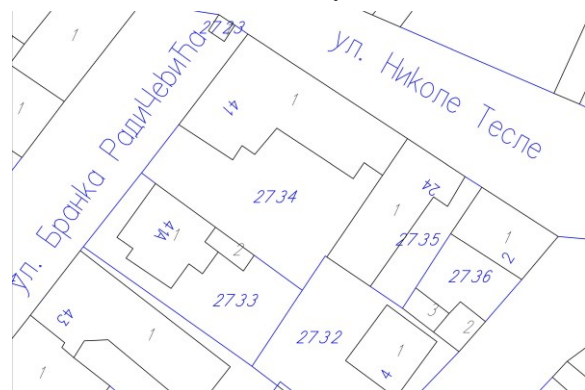
Figure 2. A sample from a vectorized cadastral map from the time of Mary Theresa (corresponding to the map in Figure 1)

There are many studies that deal with map vectorization [Boa92], [Ill91], [Con97], but the first that attempts to use neural networks to solve the complex problem of the digitization of Chinese cadastral maps and automatic extraction of high-level information was done by Chen et al. in 1996 [Che96]. The system they had developed at the time, consisted of three main parts: the separation of text and graphics, extraction of parcels and recognition of rotated characters. Even though the text and graphic separation and parcels extraction was not done by machine learning methods, they were among the first ones to propose a neural network approach to the recognition of Chinese hand-written and rotated characters. The used neural network was a two-dimensional Hopfield neural network [Hop82] which was able to reflect the degree of similarity of the test characters to previously stored templates in the final states of neurons.