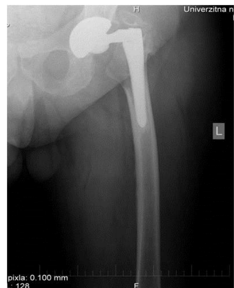
Fig. 1. The X-ray view of the cracked endoprosthesis.

and implantation condition, reducing wear rate, enhancing hip stability, increasing the range of motion and minimizing the risk of dislocation. The disadvantage of this flexibility of such system is an additional interface between the stem and the neck, which bears the risk of micromotions at the interface, resulting in a constant abrasion of the passivation layer and corrosion, especially for titanium alloys [5].