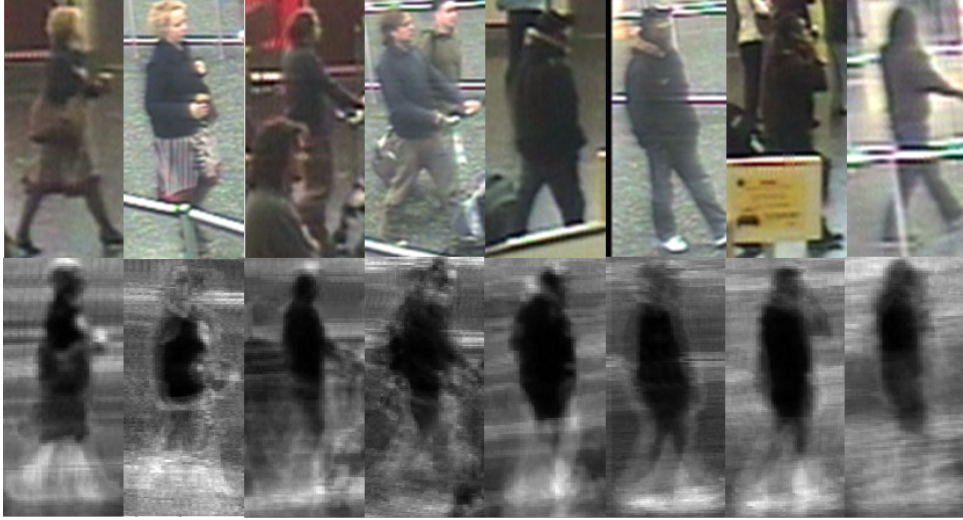
Figure 2: The top row represents example images sampled from person sequences of iLIDS-VID dataset, each 2 adjacent images represent a correct match. The bottom row includes the temporal gradient computed for these sequences and averaged over the frames involved.