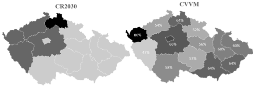
Figure 1. Regional indicator CR2030 and CVVM (average 2014–2018)