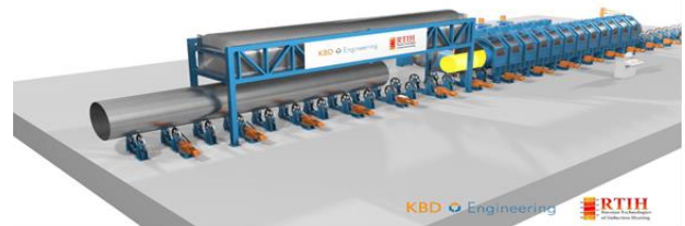
Fig.3 – Stage hardening (two separate zones: induction oscillating heating and quenching)

However, realization of a necessary mode of heat treatment by space distribution of heating and cooling zones at a constant speed of movement of pipes in many cases is difficult to pipes of big diameter and demands unfairly big power of heating. And in this case, it is preferable to realize a stage induction heating of lengthy pipes that provides flexibility at realization of heat treatment. In this way heat treatment line consists of two separate zones: induction oscillating heating and quenching [4]. After heating to the required temperature, the pipe quickly moves to the cooling zone (Fig. 3).