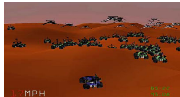
Figure 3: Mars Simulation Environment

We used NASA's 128 sample/degree data set for Mars surface (1.93GB) and 4 sample/degree data set for Moon surface. The Figure 3 is a snapshot from real-time rendering of Mars surface with 400 ground and air vehicles with 60 frames/seconds.