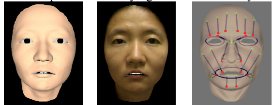
Figure 2. Reconstructed personalized face.

Fig. 2 shows the reconstructed facial model with Gouraud shading, its texture-mapped appearance, and adapted underlying muscle layer.